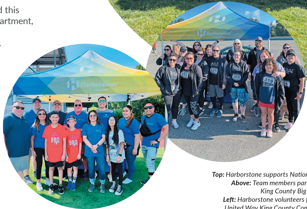
Top: Harborstone supports National Night Out. Above: Team members participate in the King County Big Backyard 5K. Left: Harborstone volunteers for the annual United Way King County Community BBQ.