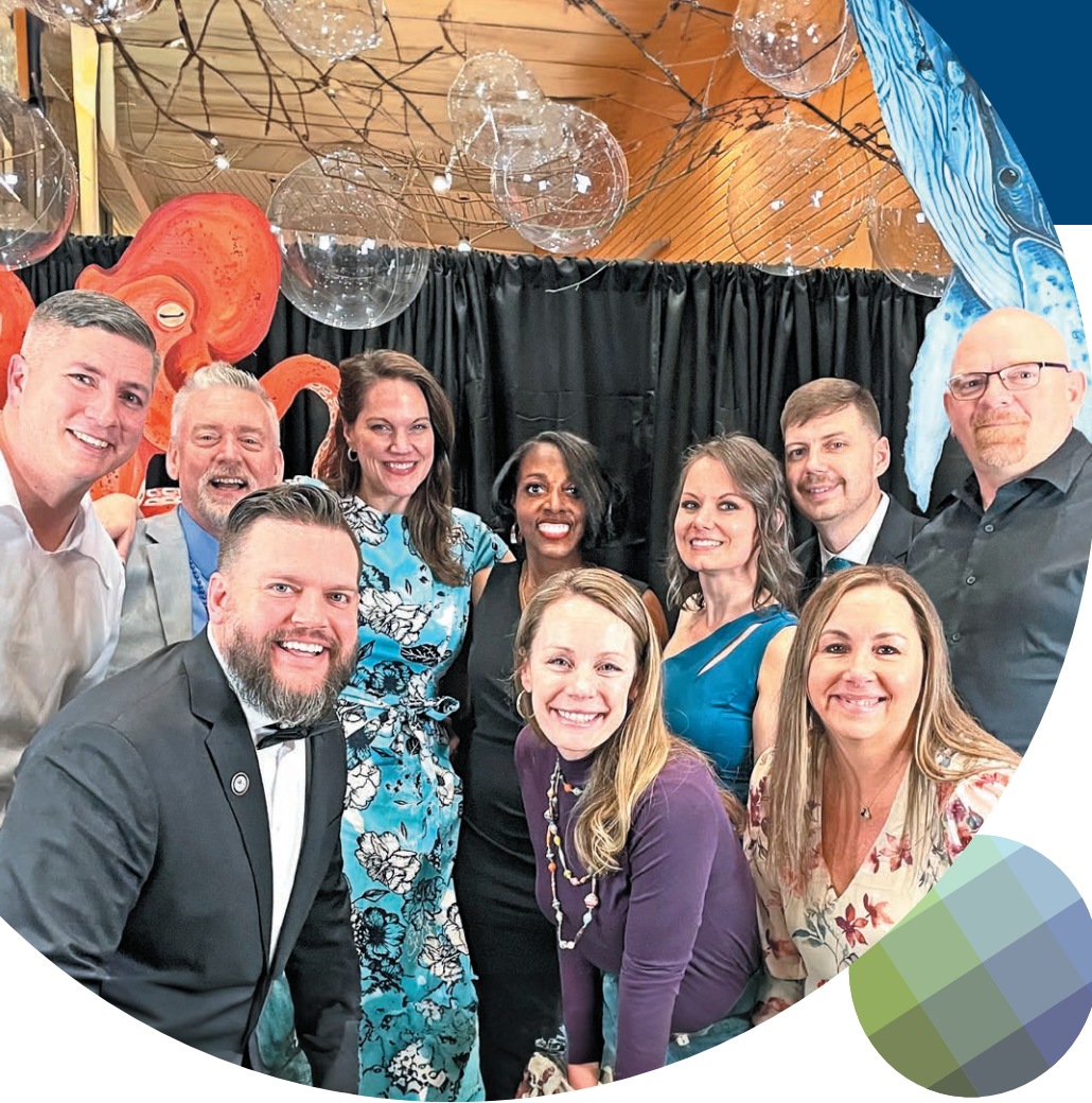
Above: Harborstone attends the annual Spouses' Club gala.

At Harborstone, we know that serving in the military presents unique hardships, with frequent moves, long separations from loved ones, and other challenges, and since we got our start at McChord Air Force Base, our local military will always hold a special place in our hearts and history. It is our honor and pleasure to support our military through sponsorships, appreciation events, and financial education throughout the year.