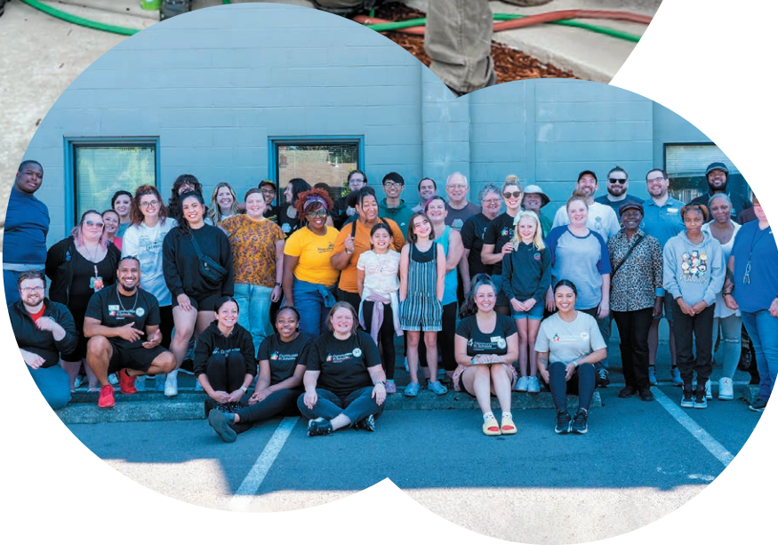
Top: Our team participates in Habitat for Humanity's home build project. Below: Harborstone sponsors Communities in Schools event.